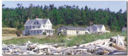
Northwest Institute of Literary Arts

universal among creative writing degree programs. Nor are they goals shared by every writer. Some are not interested in participating in the larger community of writers. Others believe it is neither desirable nor even possible to articulate clearly their understanding of the writing process; rather, they believe the process is and should remain largely unexplored. Those are legitimate perspectives, but they aren't the perspectives of this program.