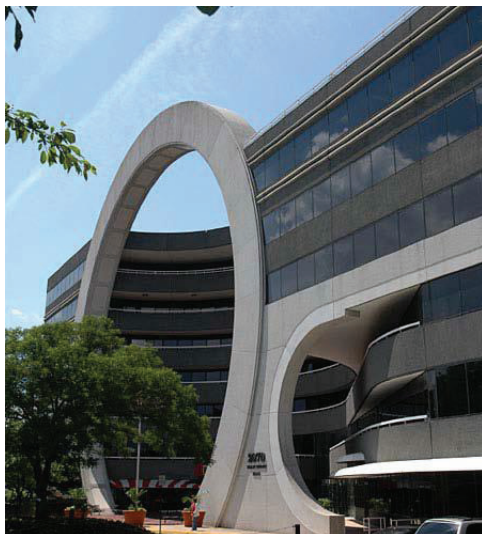
The University of Fairfax is headquartered in Tyson's Corner, Virginia.

cybersecurity community drawn heavily from this center for technology.