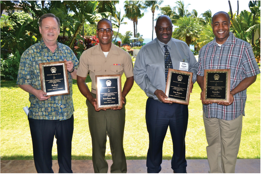
A group of DETC's 2012 Outstanding Graduates after accepting their plaques during the 86th Annual Conference, held April 15-17, 2012 in Wailea.

It is also apparent that the media exposes make significant use of the tactic of citing one or two human interest stories of unhappy, defrauded or misled students, and from these isolated experiences, generalize, stereotype and cast aspersions an entire sector of institutions.